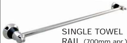
SINGLE TOWEL RAIL (700mm apr.)