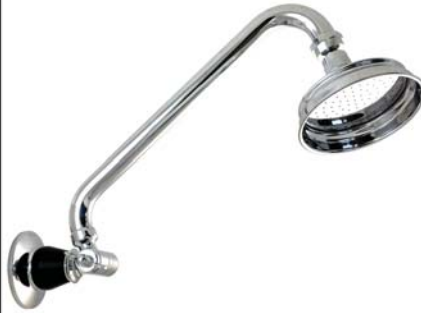
ALSO AVAILABLE IN SETS