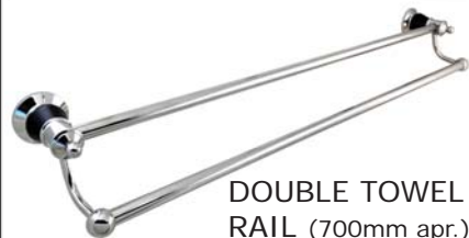
DOUBLE TOWEL RAIL (700mm apr.)