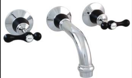
MAXUS+LEVER UPGRADE SHOWN

UPGRADE WITH MAXUS OR CERAMIC DISC FOR SUPERIOR PERFORMANCE