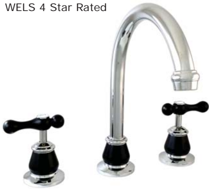
BLACK LEVER UPGRADE SHOWN