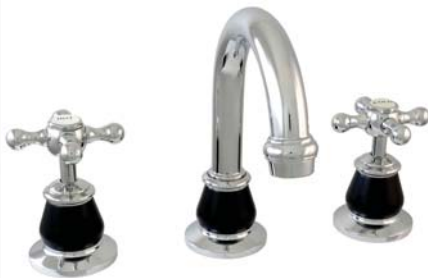
MAXUS UPGRADE SHOWN