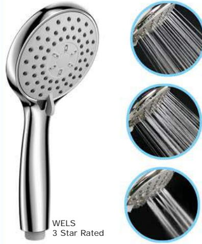
HSA180 - 3 FUNCTION HANDPIECE