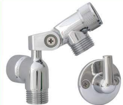
HSA32 / HSA70 PIN ELBOW / BRACKET