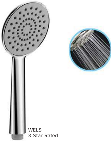
HSA140 - 1 FUNCTION HANDPIECE