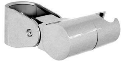
HSA62 QUIK-GRIP 32mm BRACKET