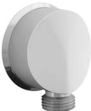
HSA55 DELUXE WALL ELBOW