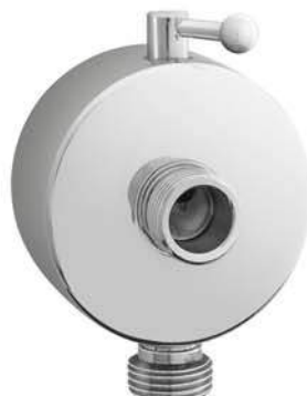
HSA60 DELUXE DIVERTER