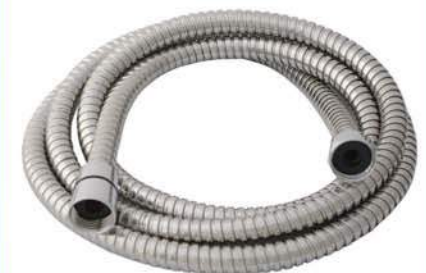
HSA44 - 2Mtr HOSE w/SWIVEL END