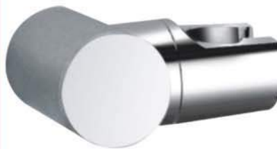
HSA10 ECONOMY WALL BRACKET