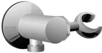
HSA14 DELUXE B/JOINT WALL ELBOW