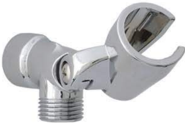
HSA59 ECONOMY WALL ELBOW